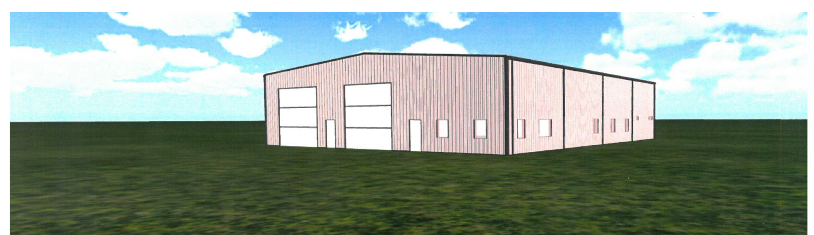
This is an architect's rendering of the 80x100-foot garage that would be built on the property for GPC's Transportation Department.

Roof Proposal and Quotes have also been obtained for the roof replacement project. The average quote was for $860,000 with an expected increase of nearly $93,000 by the end of this year because of manufacturer's price increases.