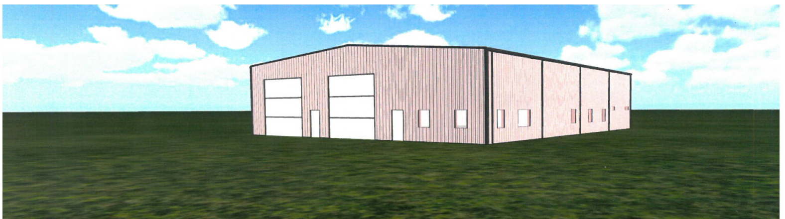
This is an architect's rendering of the 80x100-foot garage that would be built on the property for GPC's Transportation Department.

Roof Proposal and Quotes have also been obtained for the roof replacement project. The average quote was for $860,000 with an expected increase of nearly $93,000 by the end of this year because of manufacturer's price increases.