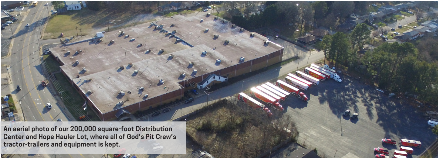
An aerial photo of our 200,000 square-foot Distribution Center and Hope Hauler Lot, where all of God's Pit Crew's tractor-trailers and equipment is kept.